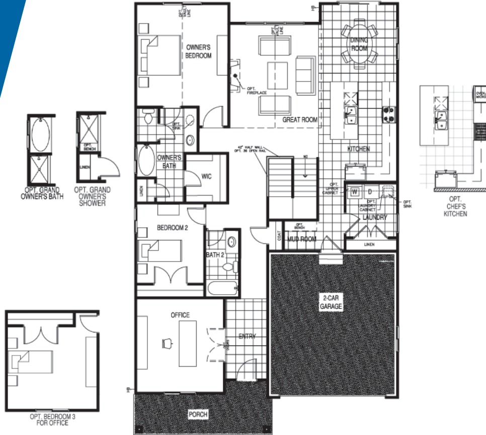
MAIN FLOOR | 2,010 SQ. FT.